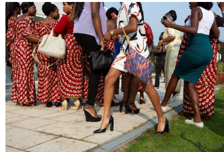
3 © Carolina Arantes