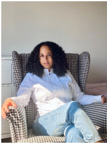
1 Portrait

„Tropes of Polarity: Visual Representation and Afrodiasporic Identities “