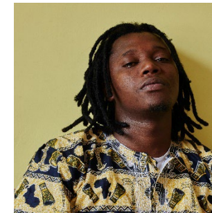
4 © Dzifa Peters