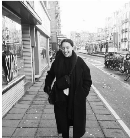
1 Portrait