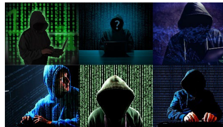
2 © Esther Gabrielle Kersley