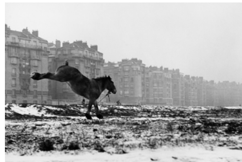
Porte de Vanves , Paris, France, 1952