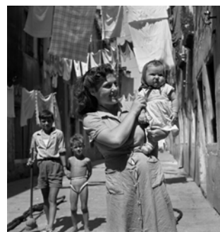
Venice, Italy, 1950