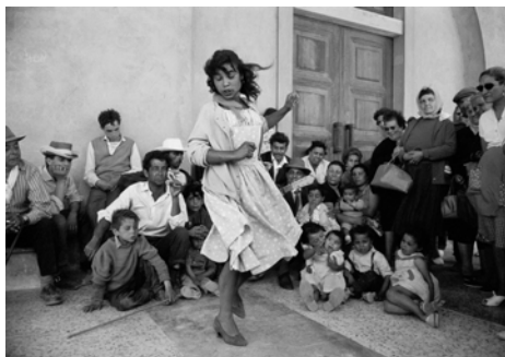
Roma , Saintes-Maries-de-la-Mer, France, 1960