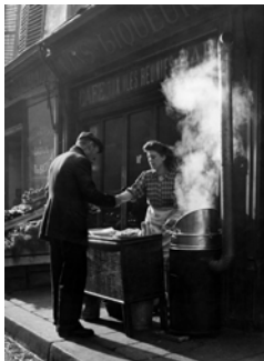
Seller of French fries, Paris, France, 1946-1950