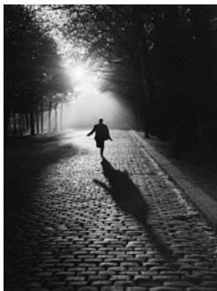
Man running , Paris, France, 1953

High-resolution print data is available for download here .