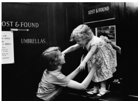
New York, USA, 1955