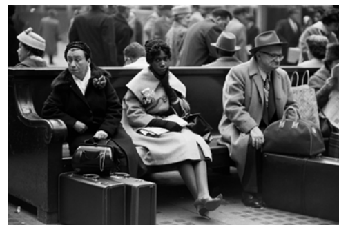
Pennsylvania Station, New York, USA, 1961-1962