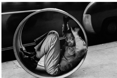
New York, USA, 1955