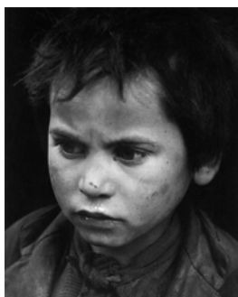
Beggar, Toledo, Spain, 1950

High-resolution print data is available for download here .