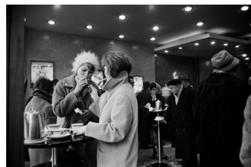
Berlin, Germany, 1962