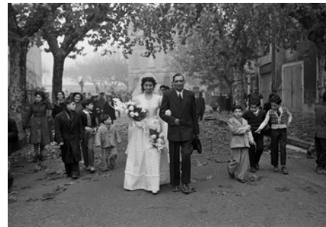
Roma wedding for Vogue , Tarascon, France, 1953