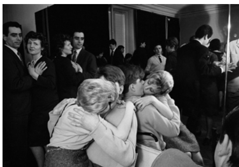
Young people, dance party, 1962

High-resolution print data is available for download here .