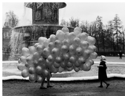
Petrodvorets Park, near Saint Petersburg, USSR, 1961