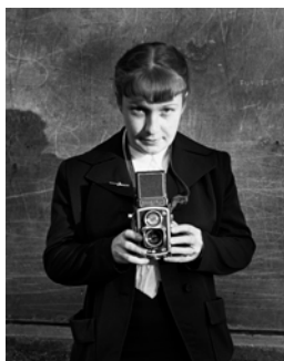
Self-portrait, Paris, France, 1953