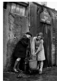
Rue des Terres au Curé , Paris, France, 1954