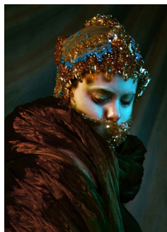
Untitled © Scallywag Fox, from the project Radical Beauty