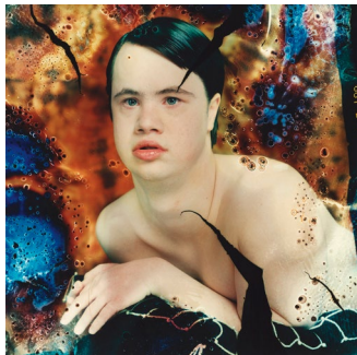
Untitled © Erwin Olaf, from the project Radical Beauty