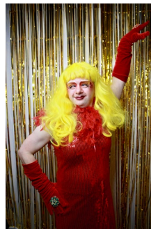
Untitled © Zuzu Valla, from the project Radical Beauty