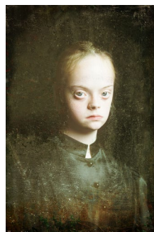
Untitled © Thomas Dodd, from the project Radical Beauty