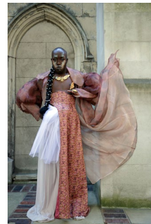
Untitled © Eva Losada, from the project Radical Beauty