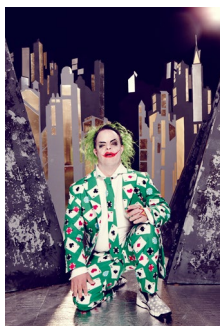
Untitled © Diana Gomez, from the project Radical Beauty