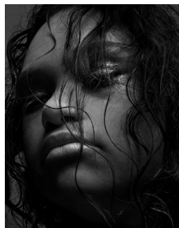
Untitled © Perttu Saksa, from the project Radical Beauty