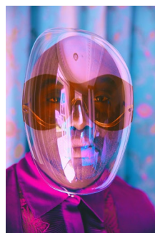
Untitled © Zuzu Valla, from the project Radical Beauty